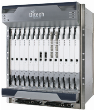
Packet Voice Processor™ 1000Base-T/SX/LX

Ditech's Codec Normalization solution is available on the Packet Voice Processor.