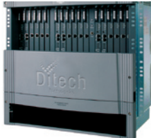
BVP Flex f100 OC-3/DS-3/STS-1/STM-1

Ditech's HEC solution for international gateways is available on the following platforms: